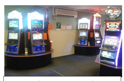
18 Modern Gaming Machines